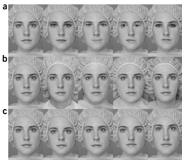
Figure 1 The face stimuli. (a) Featural stimulus set: variation in individual features (eyes and mouth). (b) Contour stimulus set: variation in the external contour of the face. (c) Spacing stimulus set: variation in spacing of the eyes and between the eyes and mouth.

We tested 20 patients treated for unilateral congenital cataract that blocked all patterned input to either the left eye (LE, n = 10 ) or the right eye (RE, n = 10 ; see Table 1 for patient details). Testing occurred later in life and after many (at least 8) years of visual experience to allow for recovery from the initial monocular deprivation. Testing was binocular; thus patients were able to use their unaffected eye when performing the task. This design allowed us to evaluate whether initial deprivation affecting the right hemisphere prevents the later development of expert face processing, despite years of visual input being available to both hemispheres beginning later in infancy, via both the expanded visual field of the unaffected eye and the recovery of the treated eye.